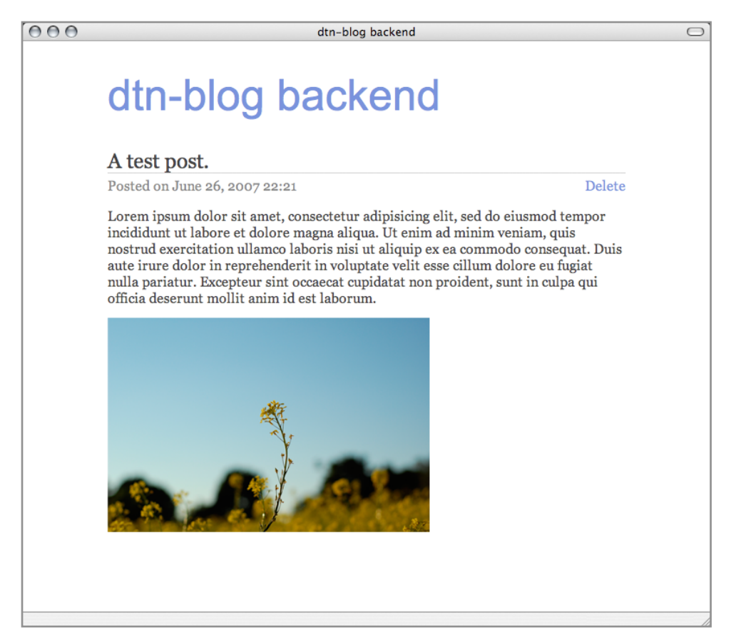
Figure 3: The public interface for reading posts.